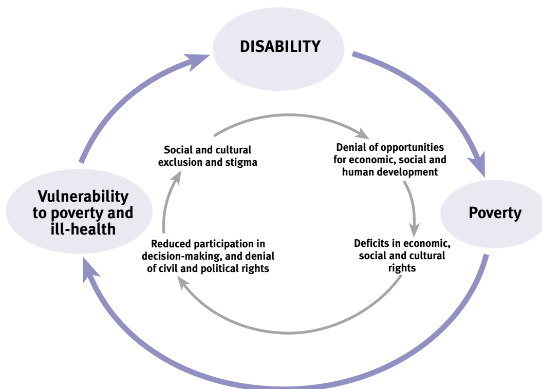
Figure 2: Poverty and disability – a vicious cycle