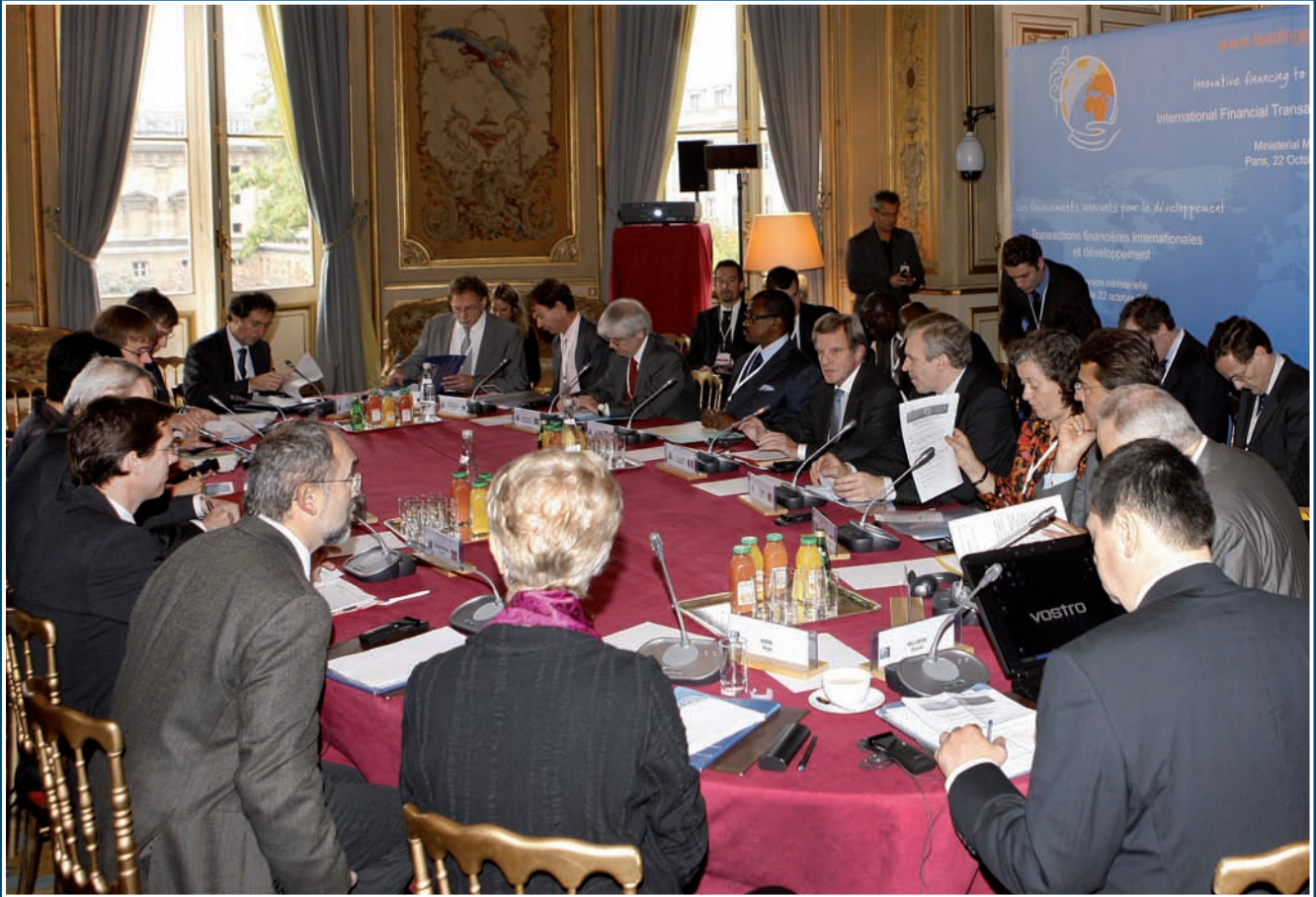
First meeting of the Taskforce, 22 October 2009

The Leading Group on Innovative Financing for development is an informal forum composed of 60 states, the main international organizations and NGOs from every continent. In October 2009, 12 countries of the Leading Group gathered in a Taskforce on Financial Transactions for Development to evaluate the feasibility of a contribution to financing for development from international financial transactions. The Taskforce commissioned internationally-recognised specialists on these issues to technically evaluate several options, carrying out studies in Brussels, Oslo, London, Paris, New York, Washington and Brasilia. We particularly thank Belgium, France, Norway and Spain for their financial support.