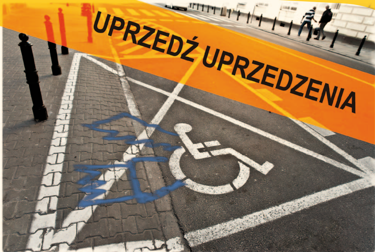
graphic design: David Sypniewski

ing hide-and-seek? Or that they are just stay-at-home types? Take a look around your neighbourhood, school, workplace, favourite pub, cinema, or theatre. For some, these are veritable obstacle courses. If you are or will be an architect, create projects with universal design in mind! Provide equal access for all! Help remove mental barriers by removing architectural ones, and vice versa!