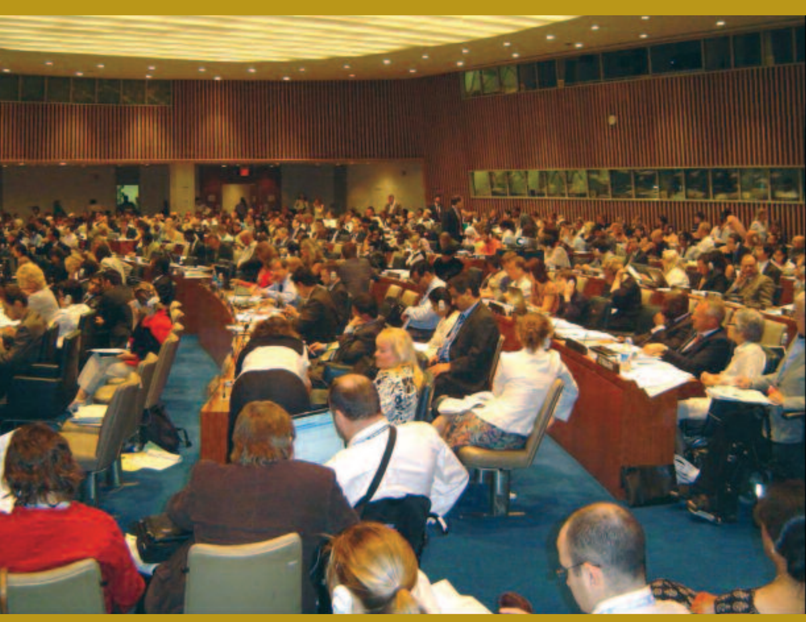
United Nations Meeting