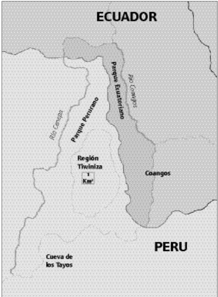
Map 4: It shows the bi-national nature parks and the area of Twiniza (written «Tiwiniza» in the map) within the marked sector of Map 4.